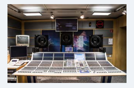
Mixing console > picture download photo